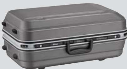
Lens Case CT-505 (included)