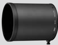
Lens Hood HK-34 (included)